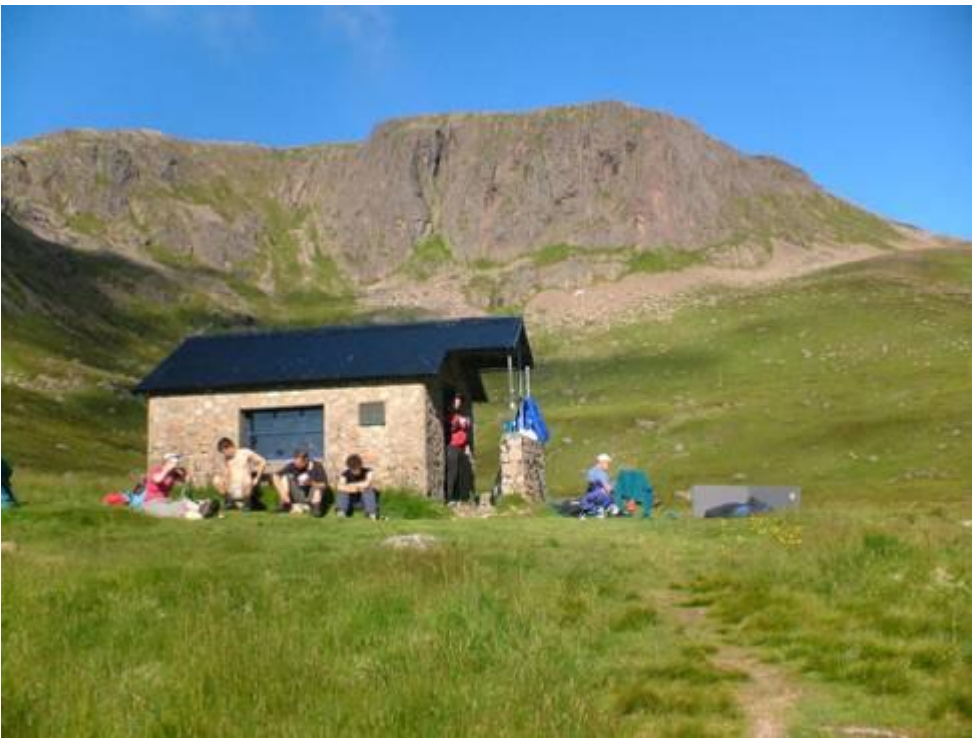
Figure-2 Hutchison Memorial Hut